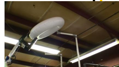
Minibot placing tube on the high peg!

Overall, good week. Keep up the work Team Driven.